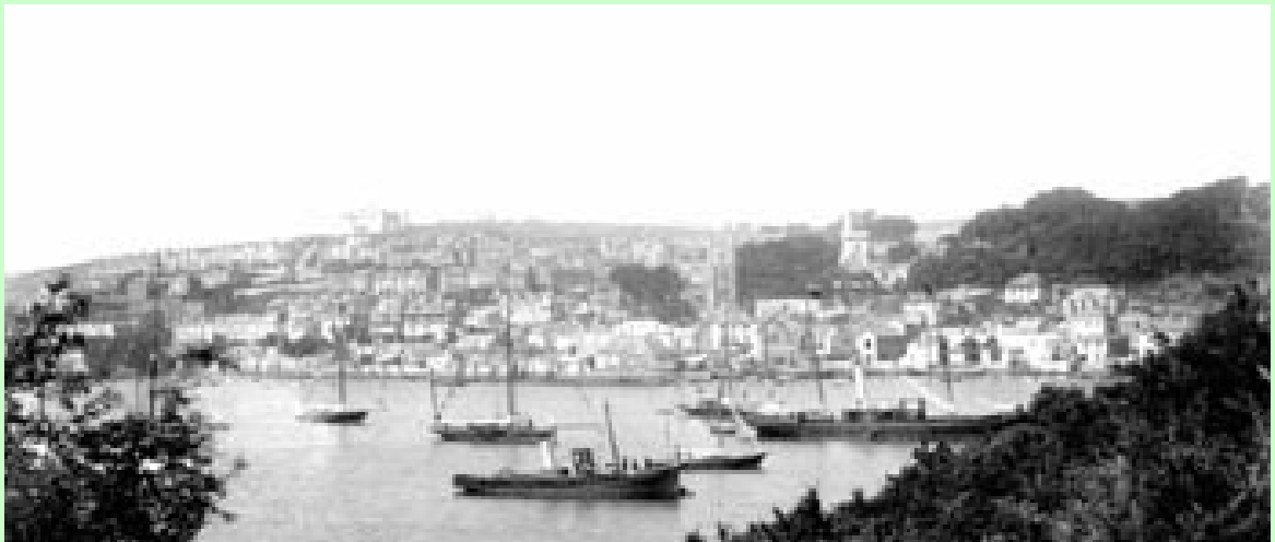
Countess of Jersey from Penleath Point during a Regatta