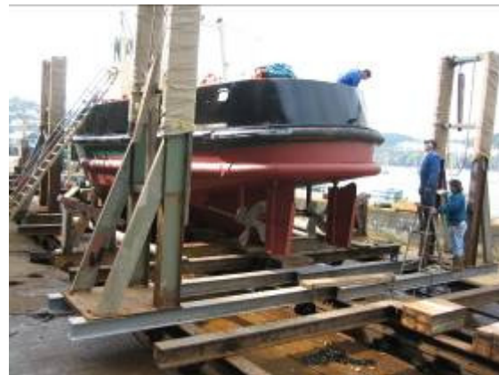
On the slipway at Brazen Island