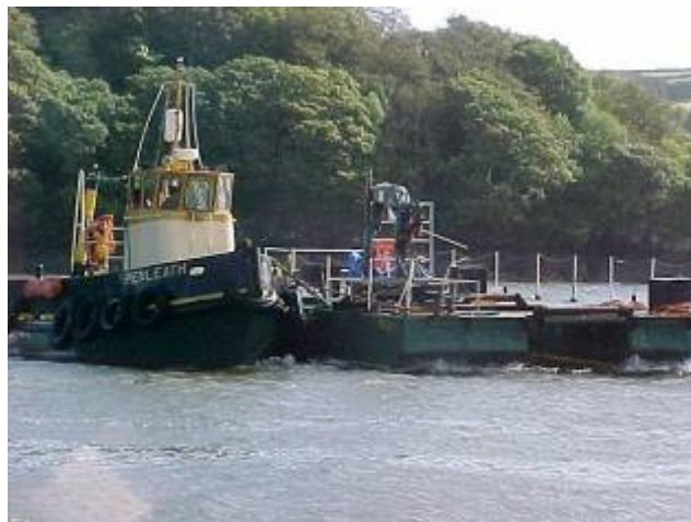
Alongside the Mooring barge "folly"