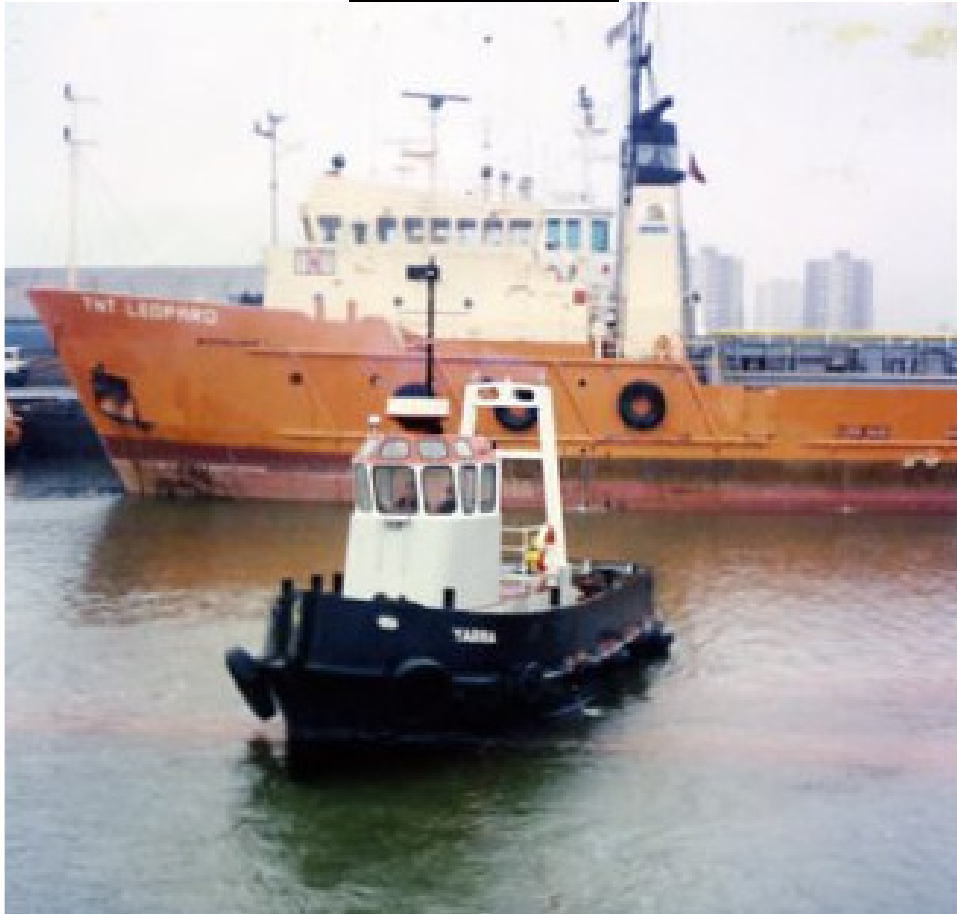
The Yarra in Hull Fish docks where she assisted large trawlers in to and out of the docks