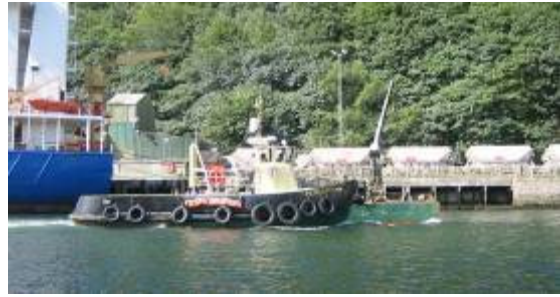
Moving the mooring Pontoon off no. 8 jetty