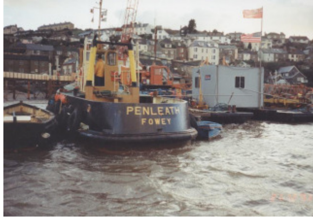
Moving plant and barges during the S.W Water sewage scheme improvements