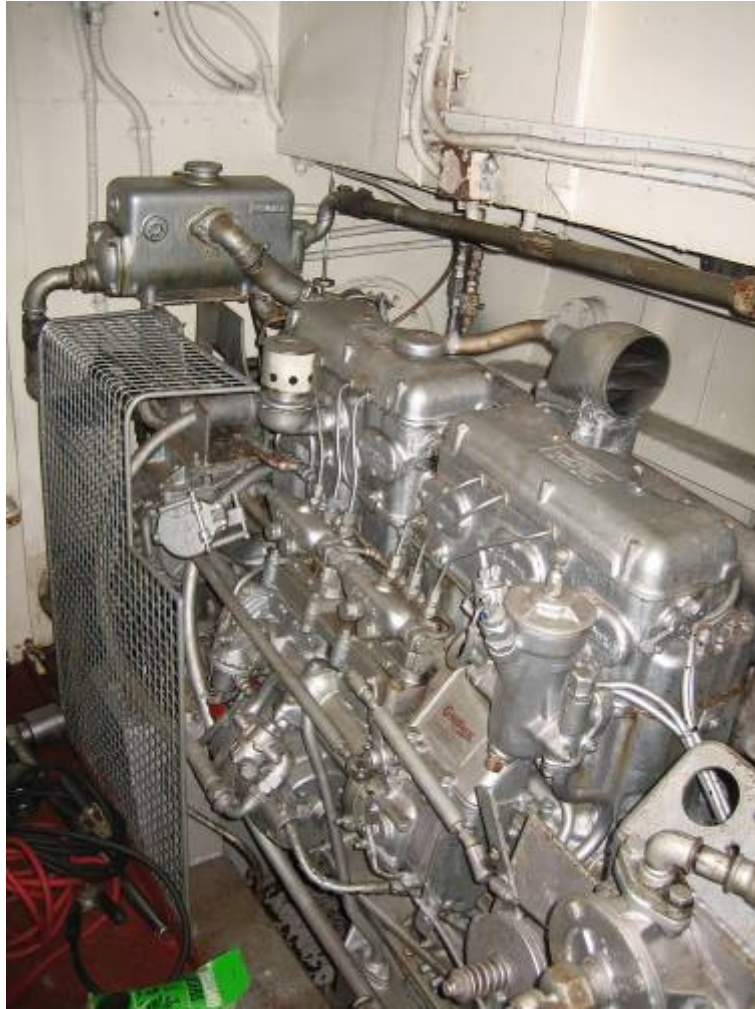
The starboard Gardner engine