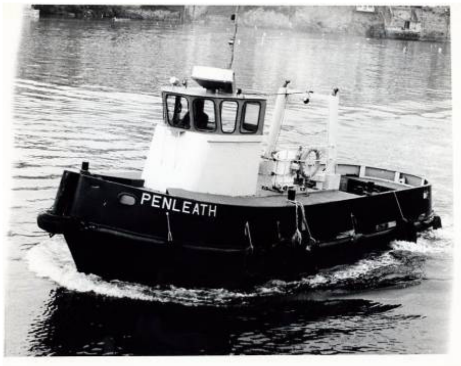
Side decks built in to provide boarding and Landing for pilots