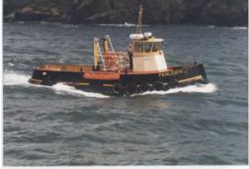
On passage to Par