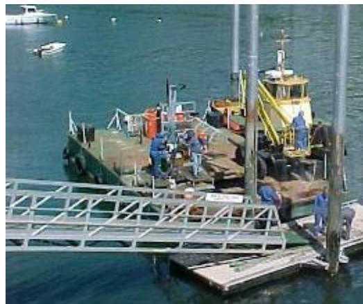
with barge for gangway installation