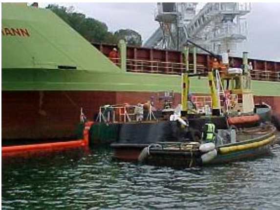
Attending an oil pollution exercise