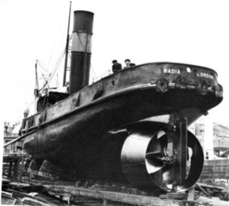
Badia on slipway having Kort nosse fitted to improve towing performance