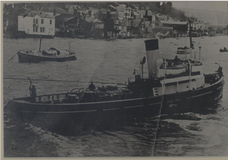
Towing a ship off the Harbour Office with Fowey Lifeboat in background