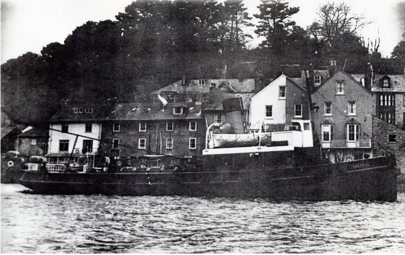
The Tactful off Riverside towing a ship upstream