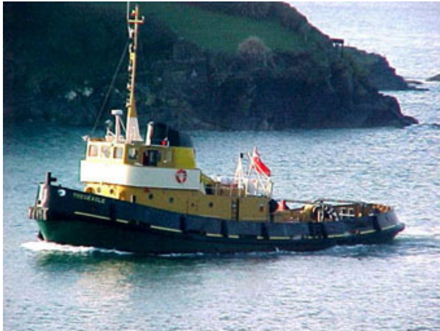
In the harbour mouth having escorted a ship to sea