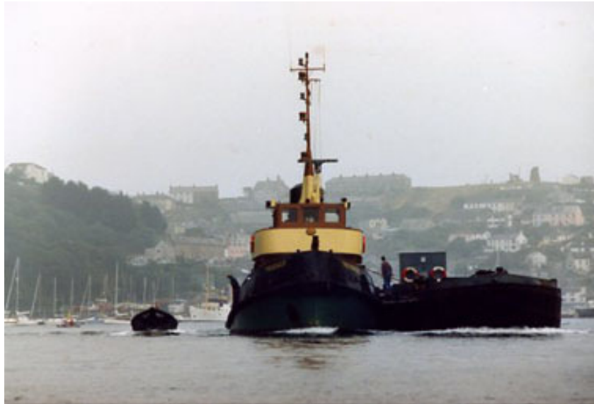
Towing a dredging barge