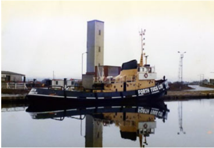
In the Dock at Grangemouth just before being sold to The Fowey Harbour Commissioners