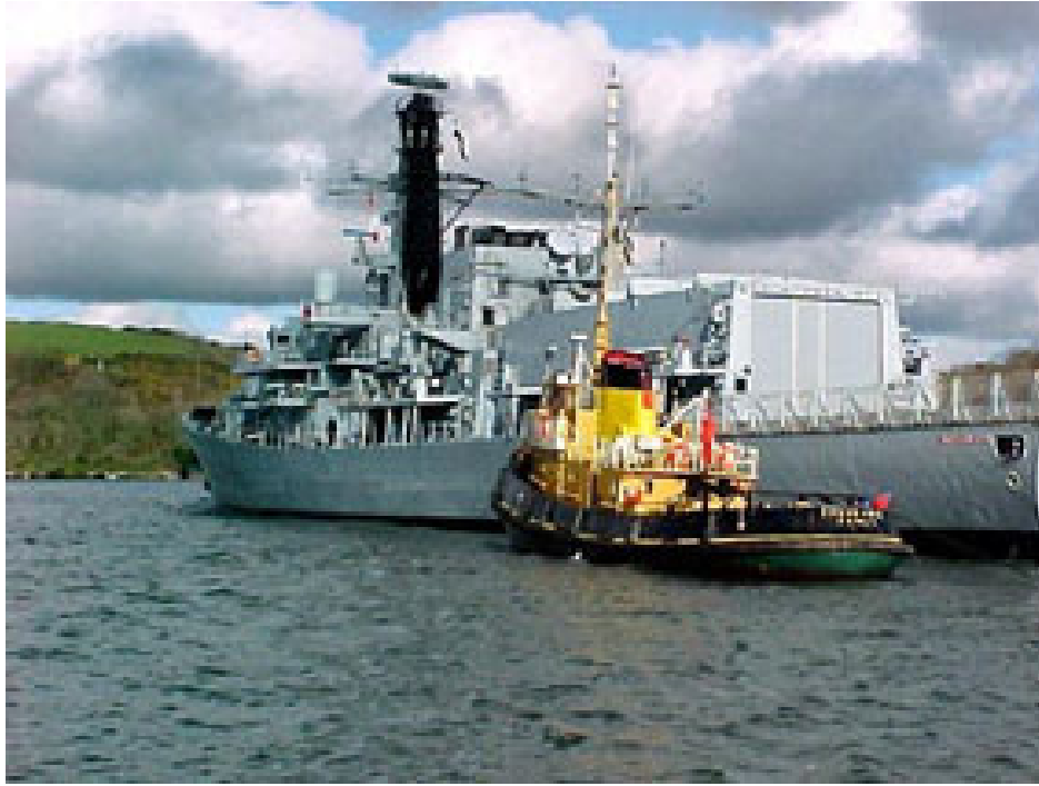
Standing by to tow H.M.S. Sutherland swinging in turning ground for Port liaison visit