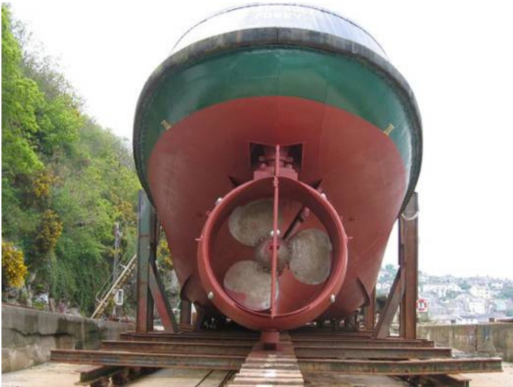
Stern view with the Kort Steering nozzle and variable pitch propeller. On the Fowey Harbour Commissioners slipway at Brazen Island