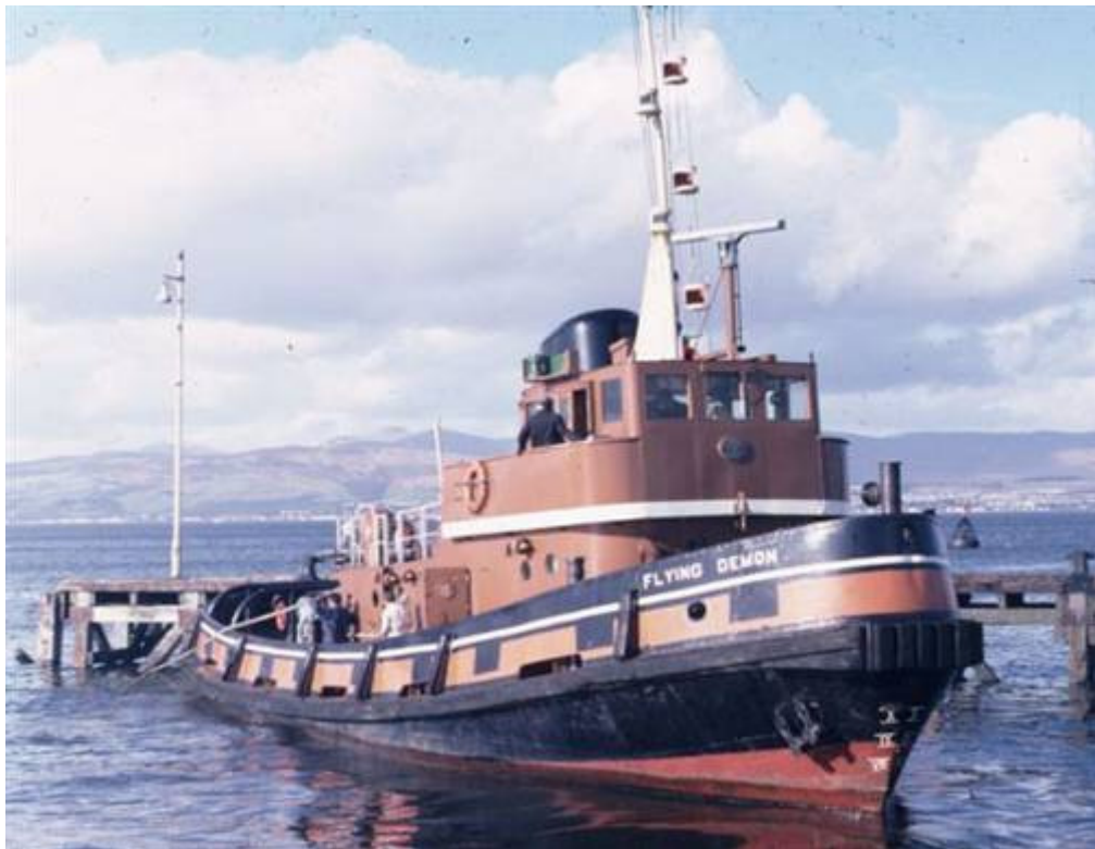
Assisting harbour works on the Clyde