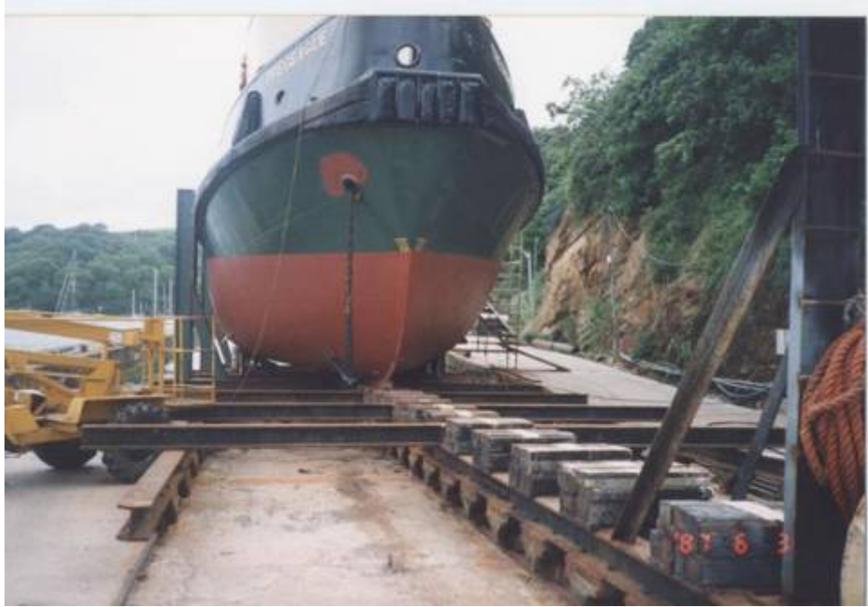
Painted and nearly ready for re- launching. Anchor hanging from hawse pipe