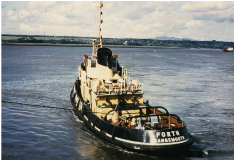
Towing a ship in Grangemouth, Forth