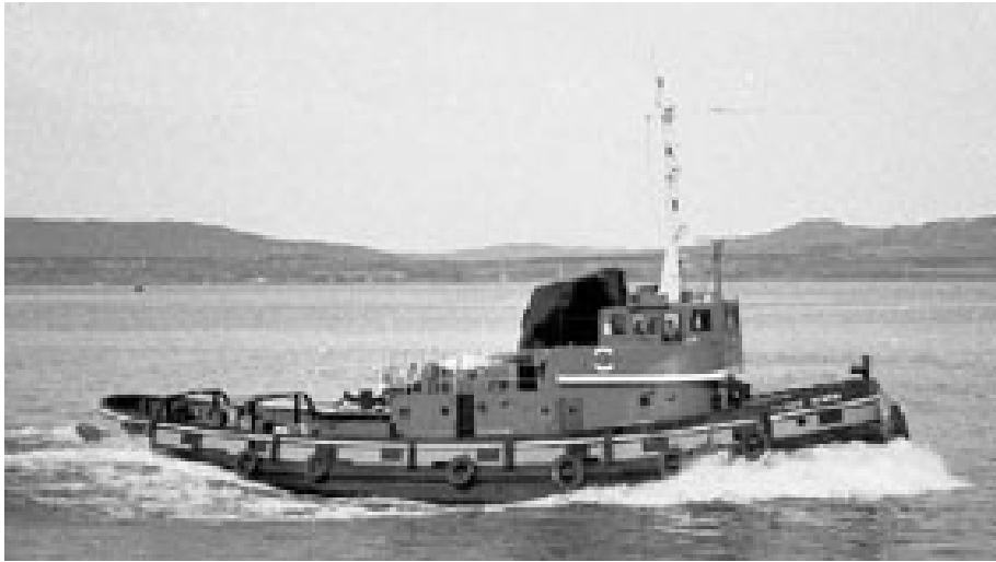
Flying Demon on the Clyde