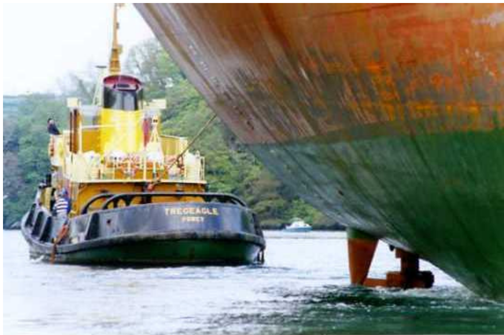
Towing the Amsterdam registered m.v. Kaapgracht