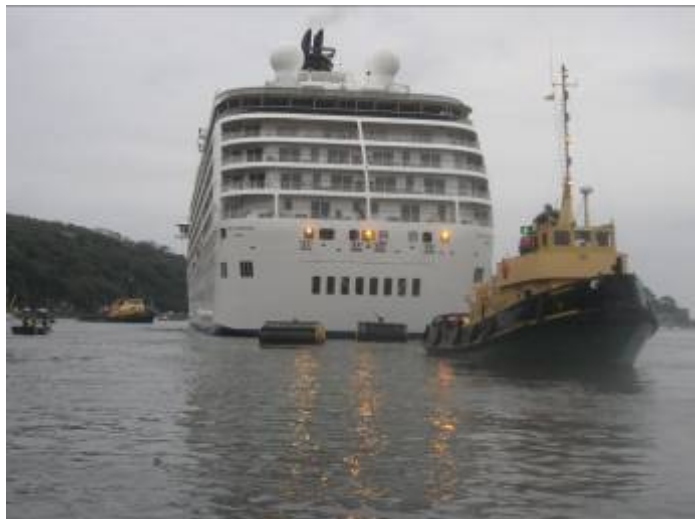
Berthing The World