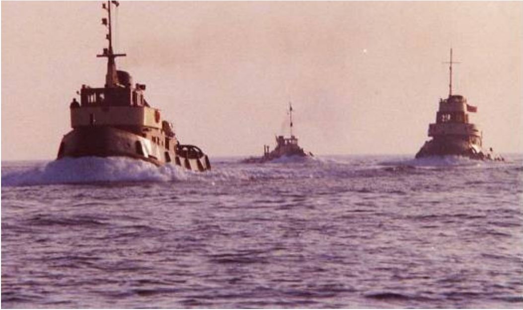
Tregeagle leading Gribbin Head and Cannis back into Fowey