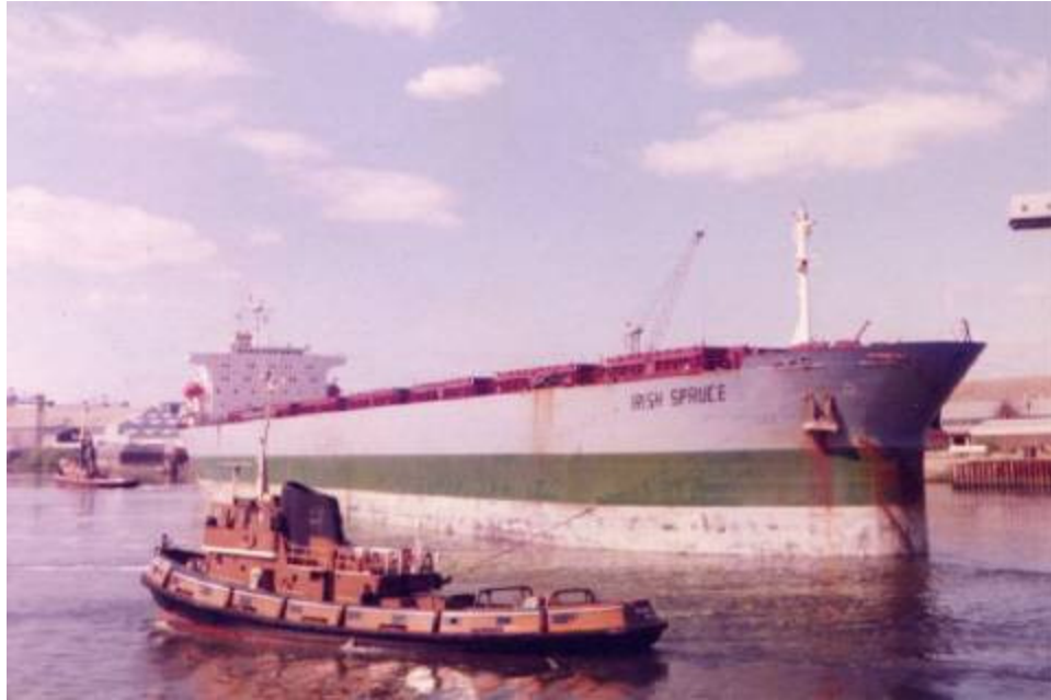
Canting IRISH SPRUCE off KGV Dock Glasgow