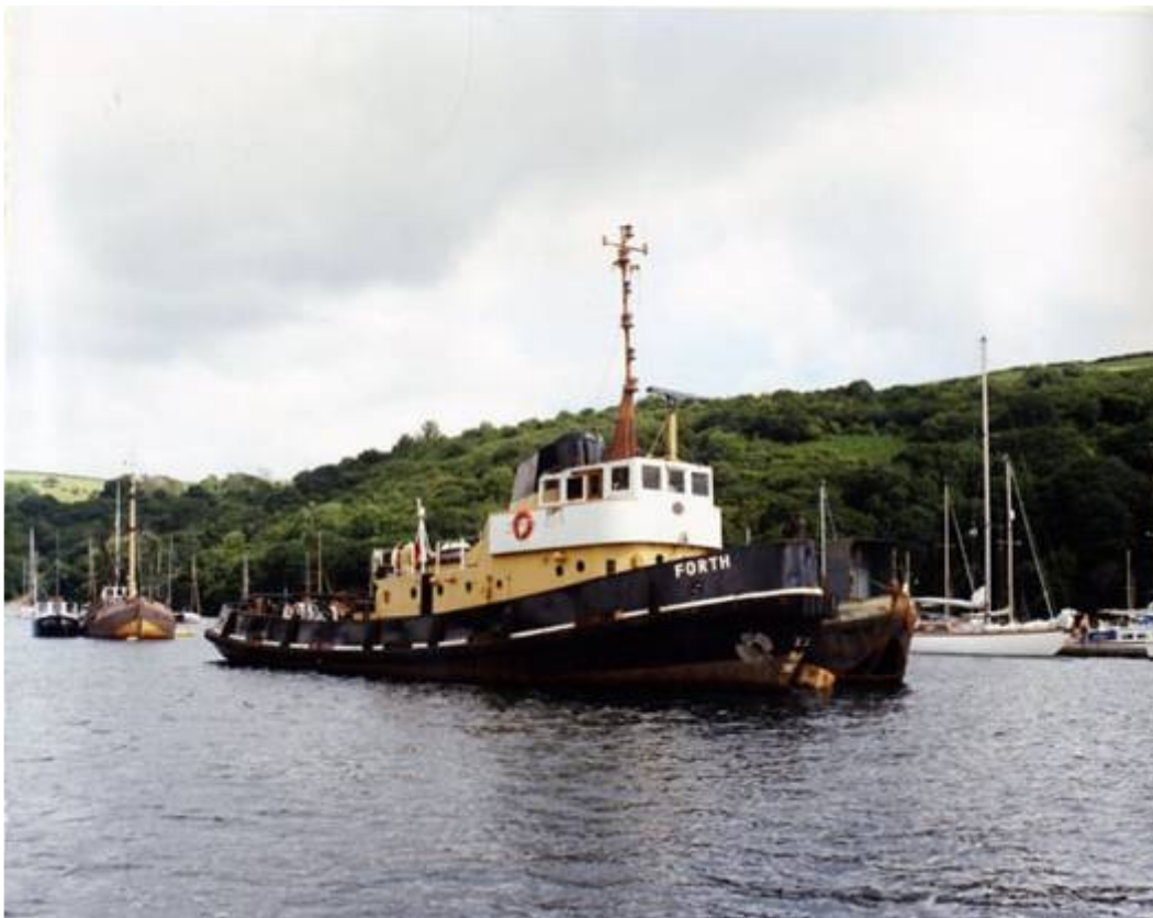
On arrival in Fowey tied up to a dredging hopper in the mouth of Pont Pill