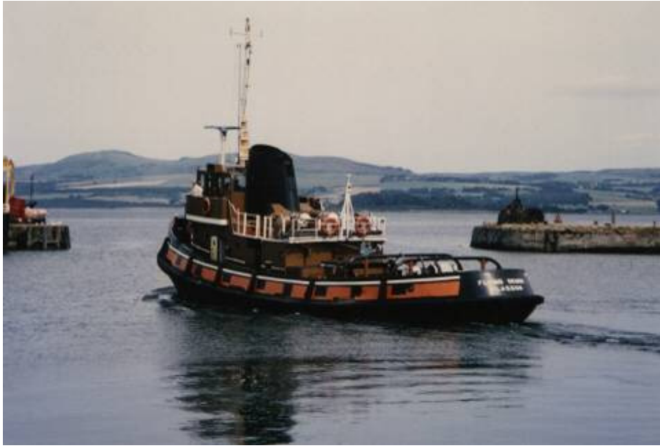
Leaving Victoria Harbour, Greenock