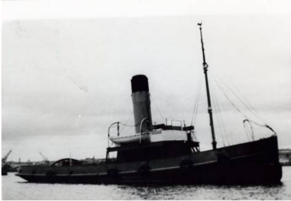
Fighting Cock on Top of Mast Head she had a large bronze cockerel weather vane