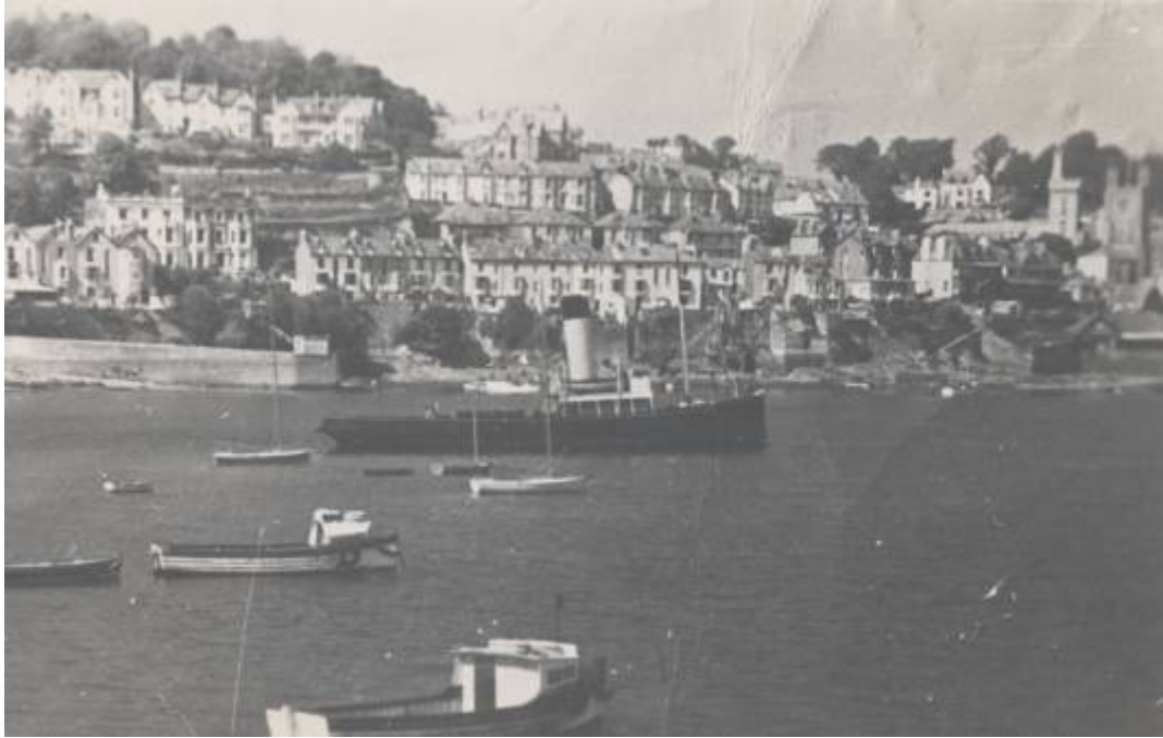
Trethosa off Whitehouse quay With Troys moored nearby from Polruan