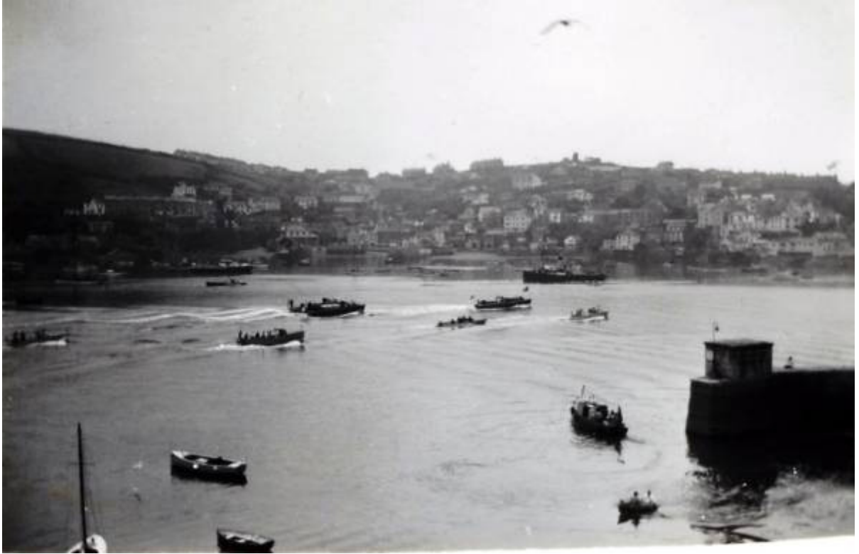
The Queen passing Trethosa in 1953