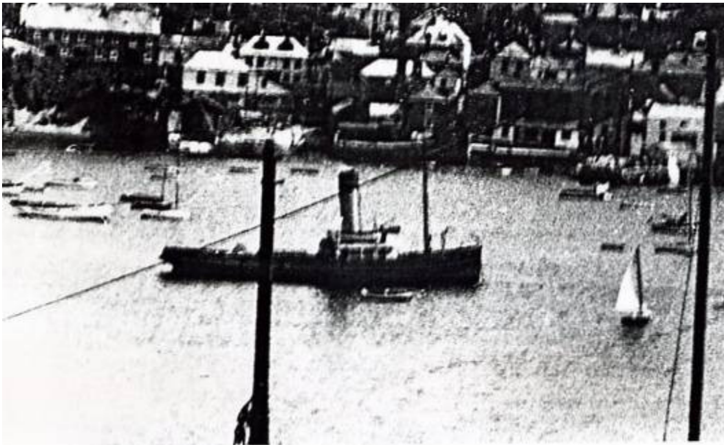
Trethosa in Polruan pool from Fowey